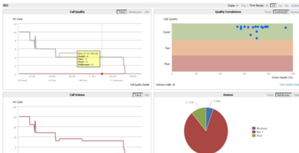
Figure 2: UCC Dashboard Example

AMON provides data to populate the charts. The UCC feature also provides a Lync overlay that shows a historic view of calls, and a Lync Mobility trail to track historic call sessions.